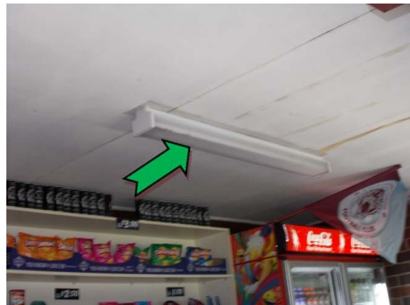
Photo 4. Interior, throughout, double tubed fluorescent light fitting – suspected non PCB-containing capacitor.