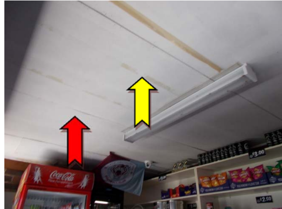
Photo 2. Interior, throughout, ceiling – asbestos-containing fibre cement sheeting and suspected lead-containing white upper paint system.