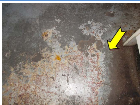
Photo 6. Interior, throughout, floor – suspected lead-containing cream and red lower coloured paint systems, and light blue upper paint system.