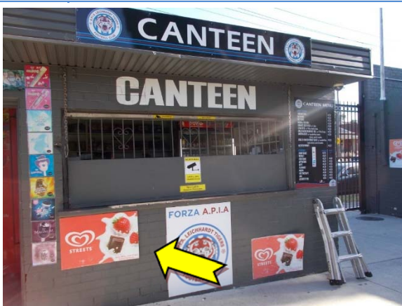
Photo 5. Exterior, throughout, walls – suspected lead-containing brown upper paint system.