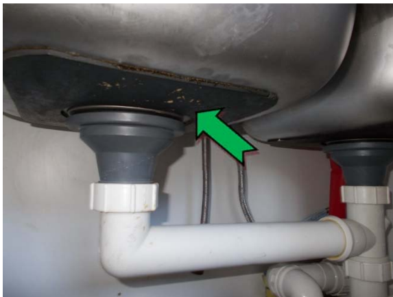
Photo 3. Interior, beneath sink, sink pad – non asbestos-containing bituminous material.